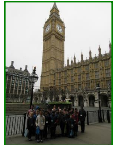
Last Year’s School Council trip to the Houses of Parliament

We are also delighted to offer School Council representatives the fantastic opportunity to visit the Houses of Parliament on 3 rd July. The trip will involve “The Story of Parliament Tour” which will take School Councillors through key events in the changing history of UK Parliament. We hope to end the tour by meeting up with our local MP, Fiona Mactaggart.